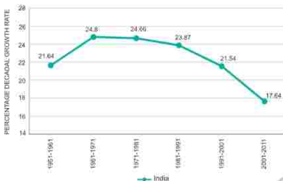
Fig. 6.4(a): India's Population Growth Rates during 1951-2011