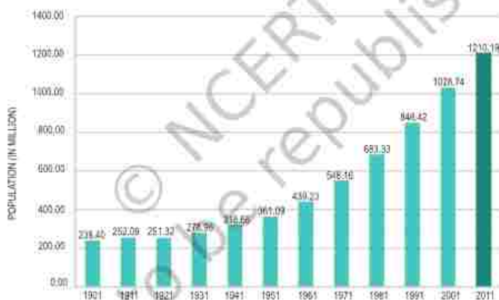
Fig. 6.4(b): India's Population 1901-2011

has overtaken China in 2023 to become the most populous country in the world. ( www.un.org .)